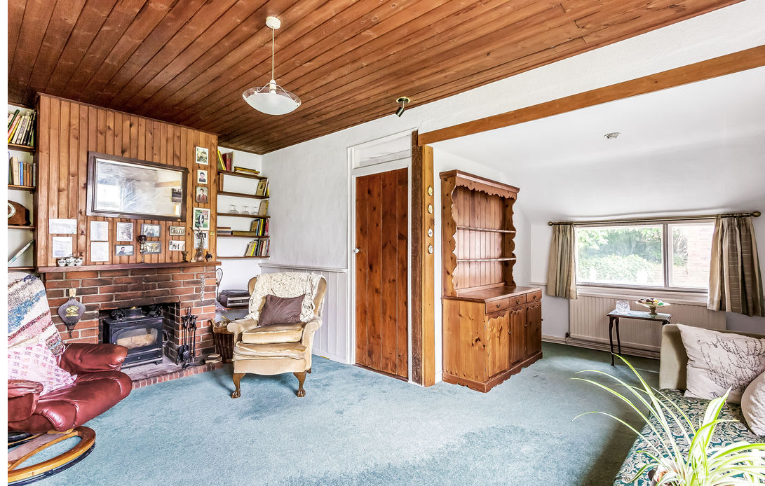
Hillside, Shelleys Lane, Knockholt, Sevenoaks, Kent TN14 7PH £975,000 - Freehold