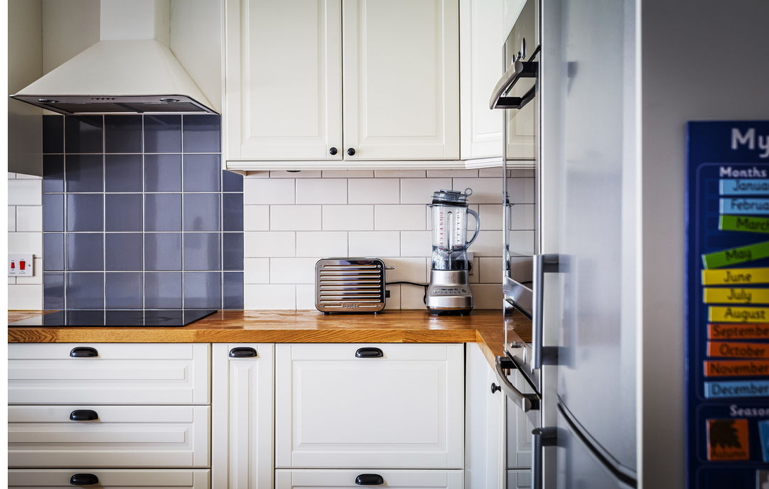
69 London Road, Riverhead, Sevenoaks, Kent TN13 2DT £495,000 - Freehold