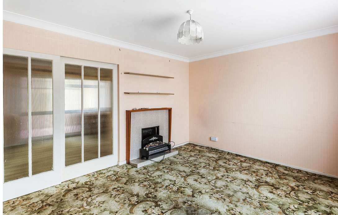
63 Chestnut Copse, Oxted, Surrey RH8 0JJ £499,950 - Freehold