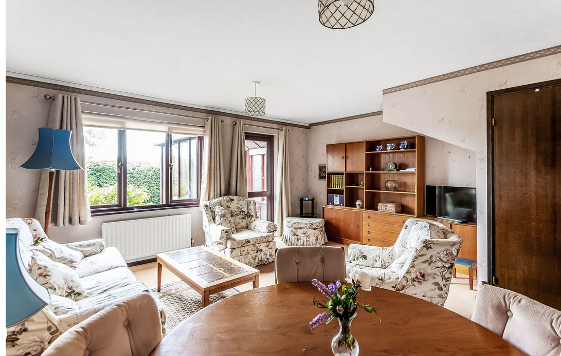
12 Padbrook, Oxted, Surrey RH8 0DW £525,000 - Freehold