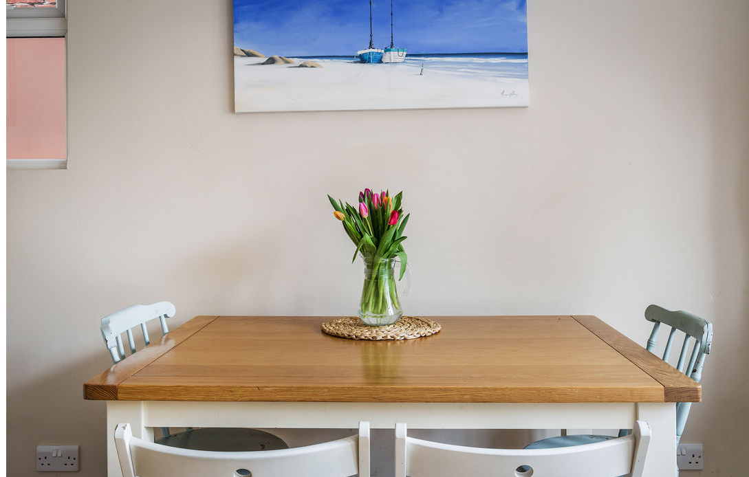
4a Holyoake Terrace, Sevenoaks, Kent TN13 1PA £450,000 - Freehold