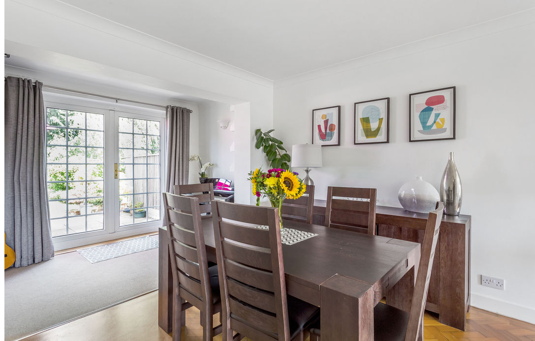
14 Orchard Road, Sevenoaks, Kent TN13 2DX £675,000 - Freehold