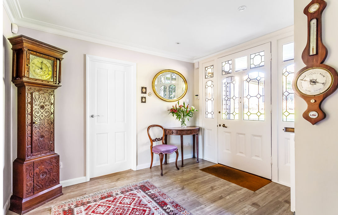
The Garden House, Brasted Chart, Brasted, Kent TN16 1LW £1,850,000 - Freehold