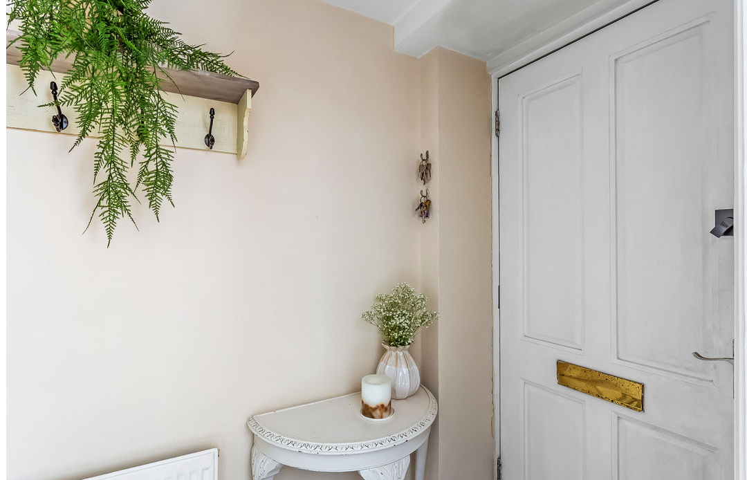
Garden Flat, 5 Mount Sion, Tunbridge Wells, Kent TN1 1TZ £275,000 -