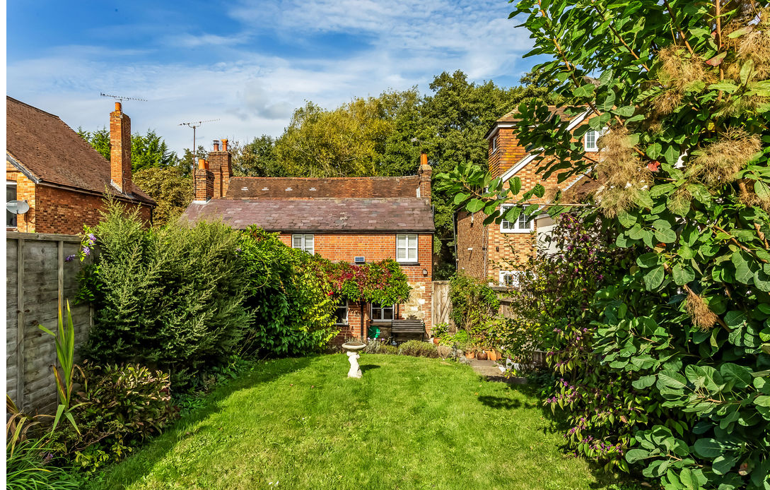
135 Jasmine Cottage, Main Road, Sundridge, Sevenoaks, Kent TN14 6EH £450,000 - Freehold