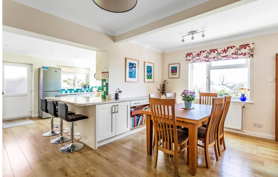
4 Oast Road, Oxted, Surrey RH8 9DX £1,300,000 - Freehold