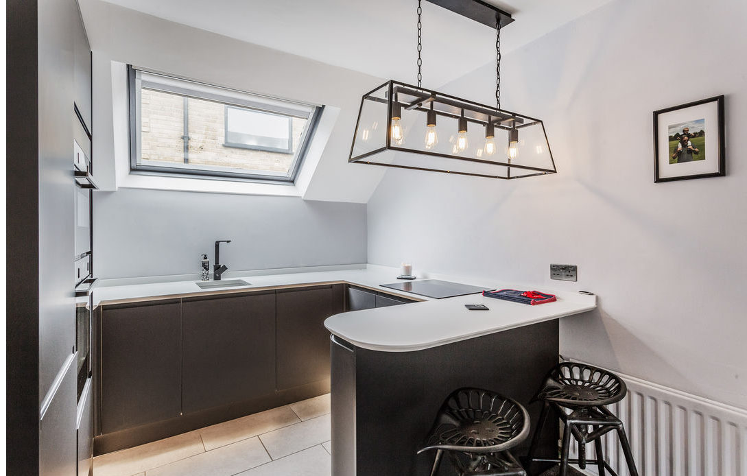
3 The Mews Hitchen Hatch Lane, Sevenoaks, Kent TN13 3BQ £450,000 - Share of Freehold