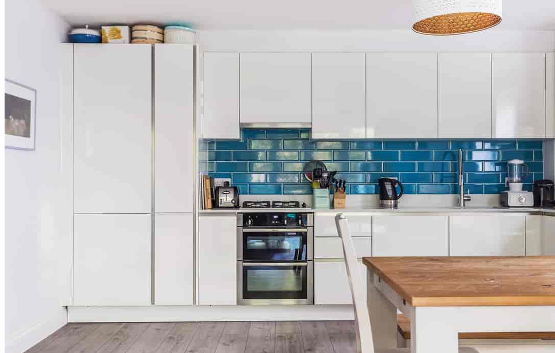
Flat 1, 22 Grosvenor Place, Station Road, Whyteleafe, Surrey CR3 0EP £400,000 - Leasehold